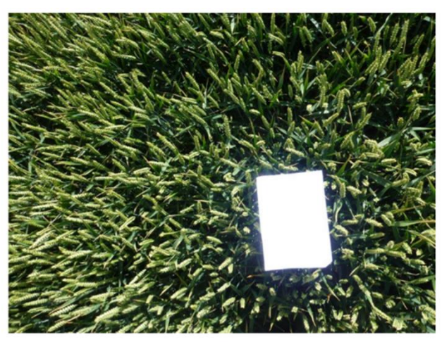
Example of digital photo of the crop after flowering