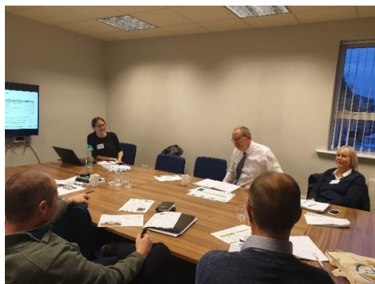
Figure 3. Amino Acid FIG discussions after the YEN Awards meeting, November 2019.

Findings from these trials suggest that under these conditions of relatively high yielding wheat crops on fertile sites the application of amino acids was not beneficial for yield and did not provide an economic benefit. If considering use of biostimulants, growers should seek independent evidence for claimed product effects and consider testing products on their farm first. However, farms should note that the precision of individual farm trials (best = 0.39 t/ha; worst = 1.19 t/ha; average CI = 0.62 t/ha) was much less than the joint precision of trials by the FIG as a whole (CI = 0.17 t/ha). If the cost of buying and applying this biostimulant (say twice) were equal the value of 0.1-0.3 t/ha grain, there is a strong case for several farms collaborating to develop a precise answer to such questions.