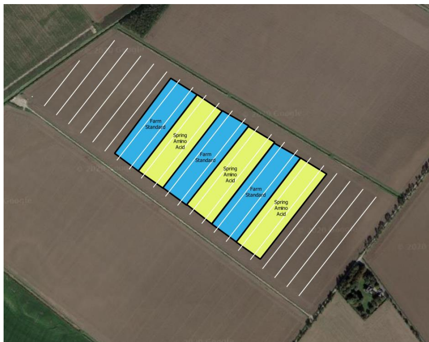
Figure 1. Example layout of amino acid tramline trial in 2018.

Each farmer set up a tramline trial designed after discussions with the ADAS facilitator (Fig. 1). The trial design was considered carefully to ensure practicality for the farmer applying the treatments and harvesting the area, but also to ensure that reliable results were obtained. This included selecting fields which would reduce the risk of treatments being compromised by underlying soil variation, and where possible, trying to replicate some treatments, and randomizing the position of treatments within the field.